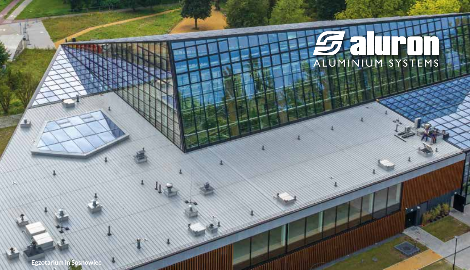
Egzotarium in Sosnowiec